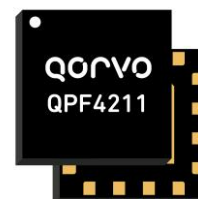
16 Pad 2.5 x 2.5 mm Laminate Package