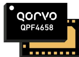
24 Pad 5 x 3 mm Laminate Package