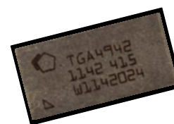
16-pin 16x8 mm SMT

The TGA4942-SL is RoHS compliant. Evaluation boards and bias boards are available upon request.