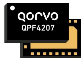
24 Pad 5 x 3 mm Laminate Package