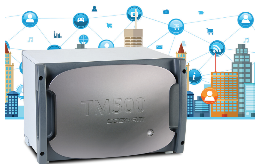
2. Cobham Wireless's test system supports carrier aggregation with unlicensed frequency bands.