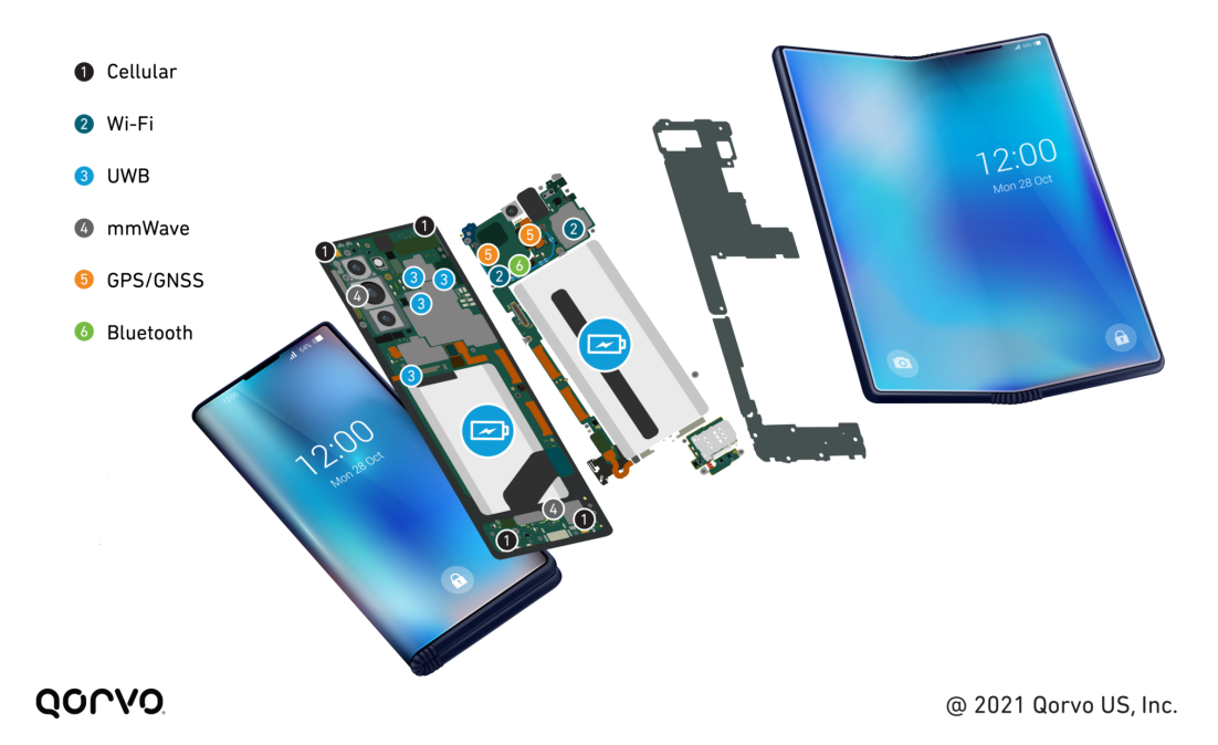
Figure 1. RF challenges continue to increase.

UWB technology, first implemented in premium phones, is also increasingly appearing in mid-tier and mass-market phones. UWB enables distance and location to be calculated indoors or outdoors with unprecedented accuracy – within a few centimeters – and it is enabling entire new categories of location-based applications and devices. As its name suggests, UWB uses channels that are at least 500 MHz wide, over a broad 3.1-10.6 GHz frequency range with a focus of 6-9 GHz in mobile applications to-date. Manufacturers are also adding the new GPS L5 and L2 bands, which offer advantages such as increased positioning accuracy for mission-critical applications.